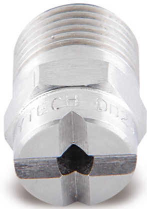
Spray Angle 60°/ 90°