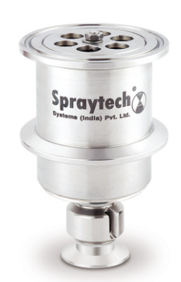
2" TC (DIN32676-A DN50)